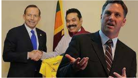
The disgraceful Australian Prime Minister

This is an outrageous comment. The use of torture is never justifiable. There is never a 'difficult' circumstance where torture should be accepted. In an unprecedented action, leading rights groups, Human Rights Watch, the Human Rights Law Centre, Amnesty International Australia, Australian Lawyers for Human Rights, and the Castan Centre for Human Rights, called for a retraction of the remarks made by the Australian Prime Minister. He is not about to do so.