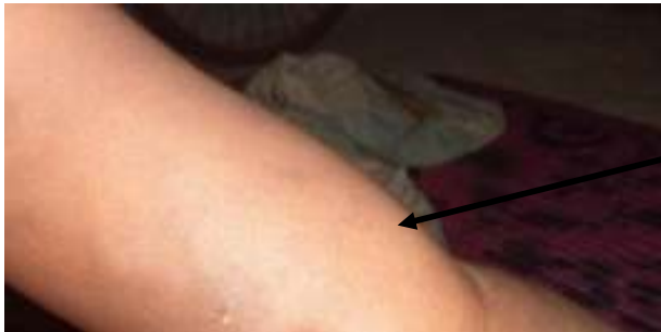
Jadelle implants in arm

In November 2012, a 26 year old Tamil woman in Kilinchchi died 10 weeks after the administration of the contraceptive. Subsequent tests showed that the woman was two months pregnant at the time of the implant.