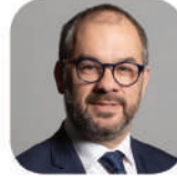
Mr.Paul Scully, Minister for London, Parliamentary Under Secretary of State for Small Business, Consumers & Labour Markets.