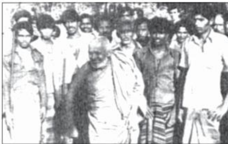
Sinhala thugs and a Buddhist monk with guns at the new settlements