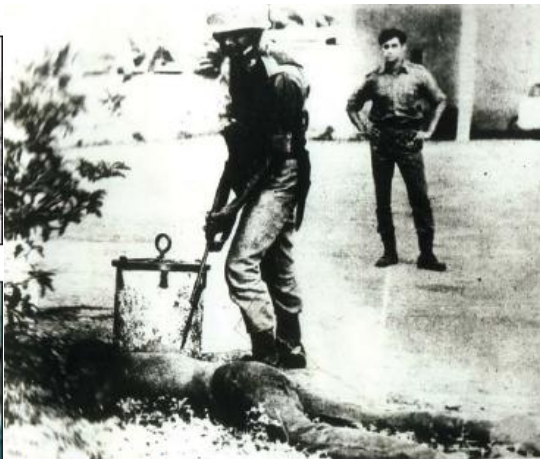
Army complicity in the riots

The US led global war on terror which allowed some states to conduct a repressive war against it minorities, accompanied by the overt and covert military and economic support of the USA, UK, India, China, Pakistan, Iran, Israel, Japan and other 'leading' governments result in the Sri Lankan state believing it has a global mandate for its genocidal war against the Tamils.