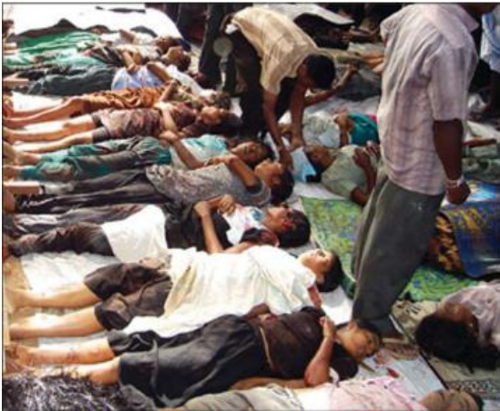
Carnage at the orphanage: Sencholai children’s home at Vallipunam, Vanni on 14th august 2006. 61 children died and 129 were wounded.