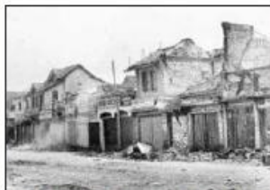
Devastation of Tamil neighbourhood