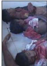
School children killed by the Sri Lankan forces