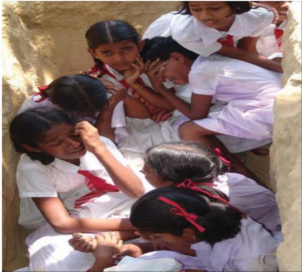
Tamil school children taking cover from aerial bombing

The onset of Tamil armed resistance in 1983 followed 35 years of peaceful protest, which was met by the repeated brutality and carnage of the Sinhala Sri Lankan state and its racist thugs.