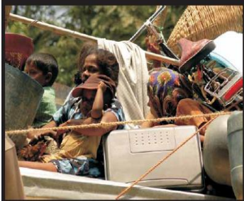
Tamil IDPs July 2008. One third of the Tamil population are IDPs, another third have fled overseas.