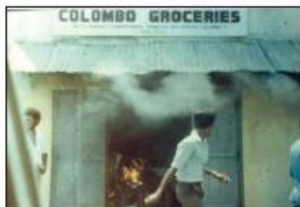
One of the many Tamil businesses torched in Colombo