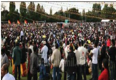
Over 100,000 Tamils at the Pongu Tamil (Tamil uprising) in Canada