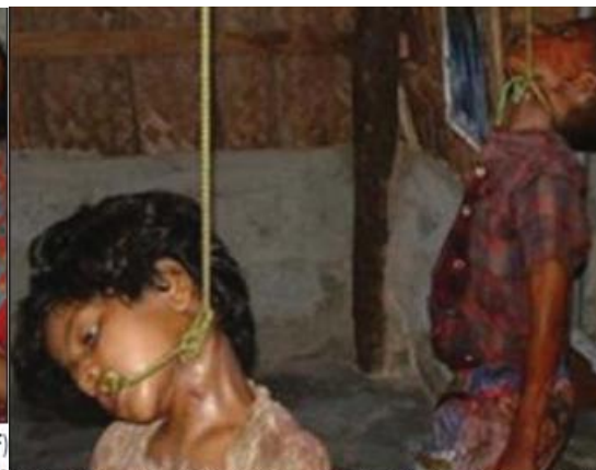
The whole family was brutally tortured and killed by the Sri Lankan Air Force (SLAF) personnel in Vankalai, Mannar (9th June 2008). The bodies were exhibited to intimidate the population.