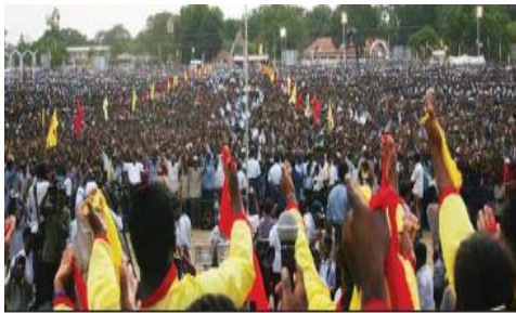
▲ Pongu Tamil uprising in Tamil Eelam 2004 ▼ 40,000 Tamils at the Pongu Tamil in London 2008

Tamil Eelam may not be achieved tomorrow but as surely as day follows night, there can be no more certainty than that the Tamil people’s will cannot be denied forever. The pain, anguish, suffering, death and destruction can be foreshortened with your understanding, help and action – please act now (see attached sheet)!