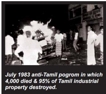
July 1983 anti-Tamil pogrom in which 4,000 died & 95% of Tamil industrial property destroyed.