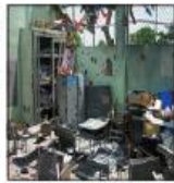
Classroom devastated as a result of aerial bombing by SLAF