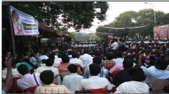
▲ Tamil Nadu, India: Tamils of all political parties showing their solidarity with Eelam Tamils