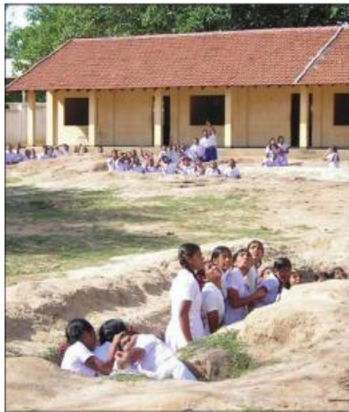
Many Tamil children were killed in aerial attacks on schools