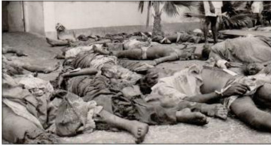
The army ordered civilians to take refuge in Navali St Peters church and then bombed the church killing over hundred and injuring 120 including women and children (9th October 1995)

Far away in distant Sri Lanka and hidden from our gaze, the government continues its daily slaughter of Tamil children and civilians. The skies rumble and the earth shatters as they use cluster bombs and fuel-air explosives, the latter banned under the UN Convention on Genocide, to kill over 80,000 civilians and displace over 500,000 people.