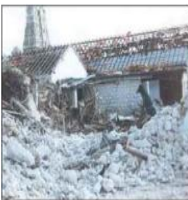
Bombed churches and temples

Whilst the Gaza atrocities occupy our attention, the Sri Lankan government's daily aerial and artillery bombardment flattens homes, schools, hospitals, temples and churches and has killed many thousands. Two generations of Tamil children are left without proper education, food and medicine. The old and the infirm cannot flee any more. This is the scale of the ongoing genocide.