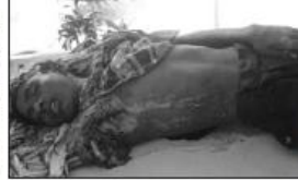
Victims of aerial bombing in Kilinochi (2008). Indiscriminate bombing raids by supersonic fighter jets in the Tamil homeland is a daily occurrence.